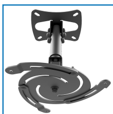
3 mounting holes