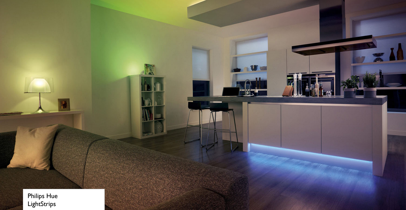
Philips Hue LightStrips