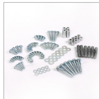
All mounting hardware included