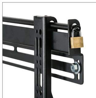
Security locking screws, Allen key and locking bars provided for a secure installation