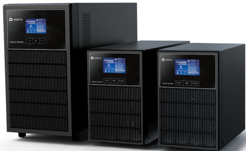
Liebert GXT MT+ 1 kVA - 3 kVA Gen. 2