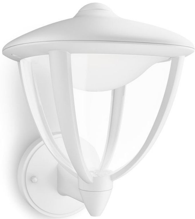
PHILIPS myGarden Wall light Robin white LED