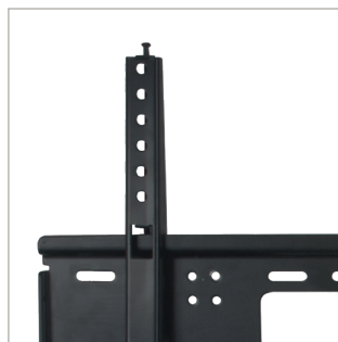
Adjustment screws allow screen to be levelled once mounted