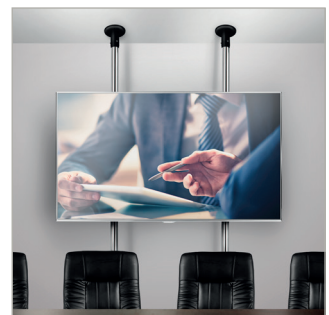
Compatible with B-Tech's collar and pole system for pole mounting heavy duty screens