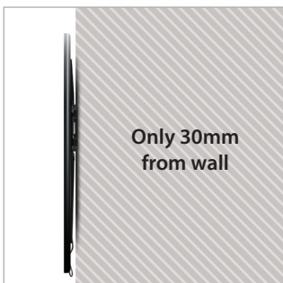
Ultra-Slim design mounts screen only 30mm from the wall