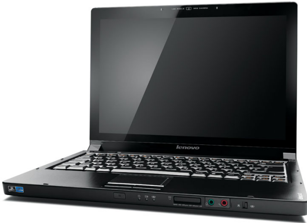
Lenovo IdeaPad U330