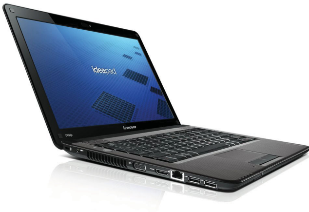
Lenovo IdeaPad U450p