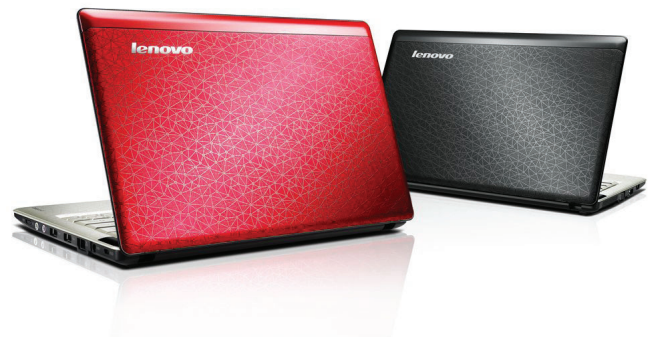
Lenovo IdeaPad U150