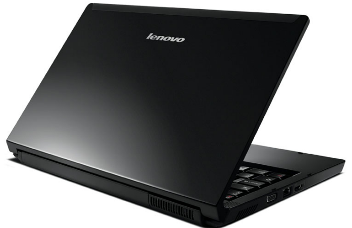
Lenovo IdeaPad U330