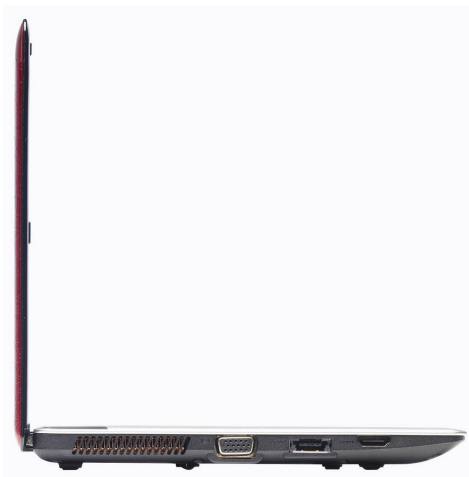
Lenovo IdeaPad U150