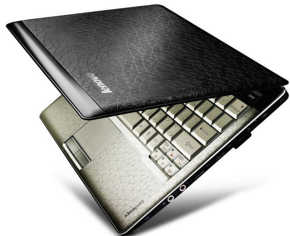
Lenovo IdeaPad U150 black cover