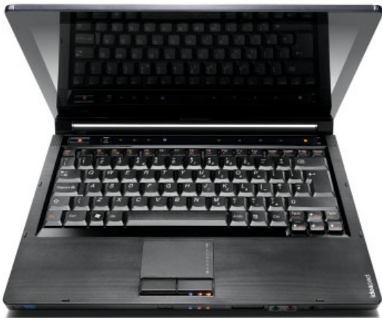
Lenovo IdeaPad U330