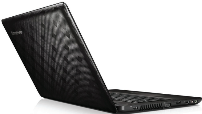
Lenovo IdeaPad U550