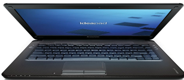
Lenovo IdeaPad U450p