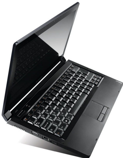
Lenovo IdeaPad U330