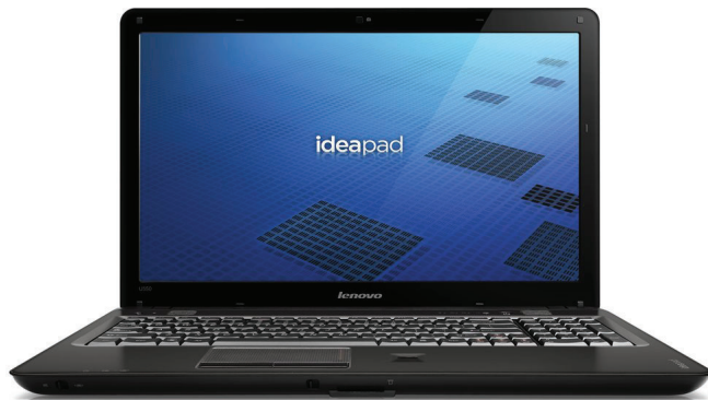
Lenovo IdeaPad U550