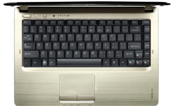
Lenovo IdeaPad U350