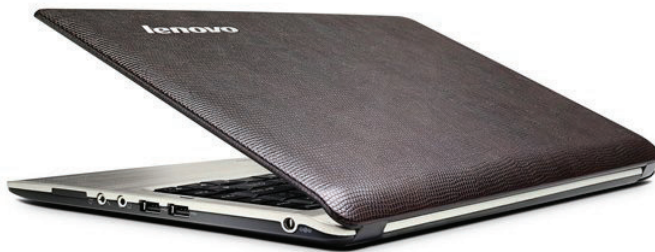
Lenovo IdeaPad U350 with with Lizard Skin pattern cover