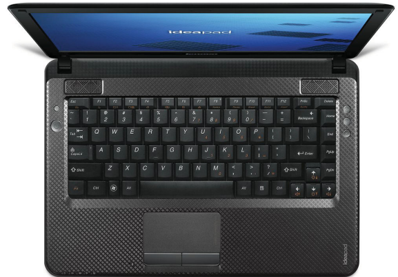
Lenovo IdeaPad U450p