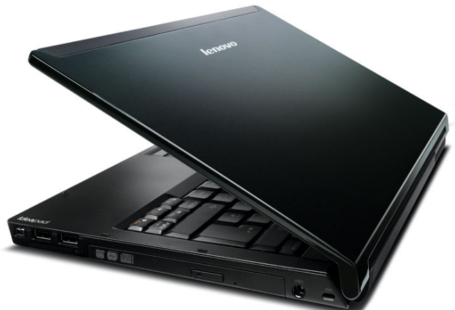
Lenovo IdeaPad U330