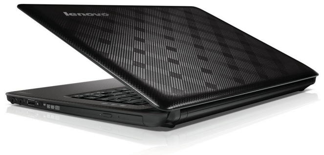
Lenovo IdeaPad U450p