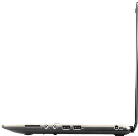
Lenovo IdeaPad U350