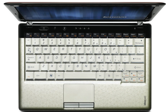
Lenovo IdeaPad U150