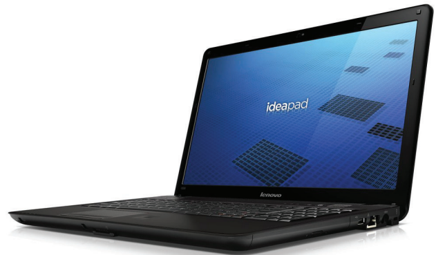
Lenovo IdeaPad U550 cover