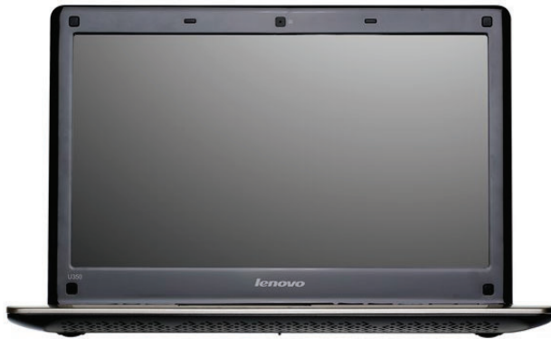
Lenovo IdeaPad U350