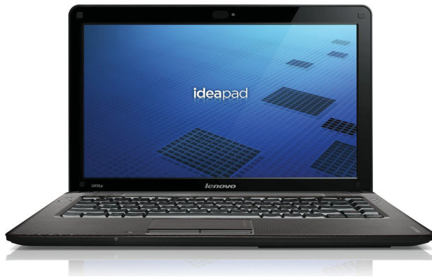
Lenovo IdeaPad U450p