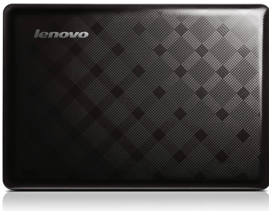
Lenovo IdeaPad U550