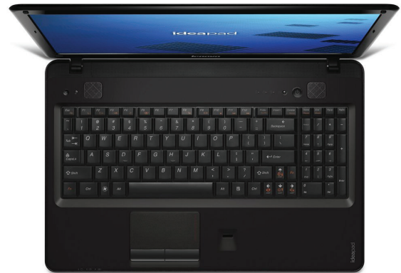
Lenovo IdeaPad U550