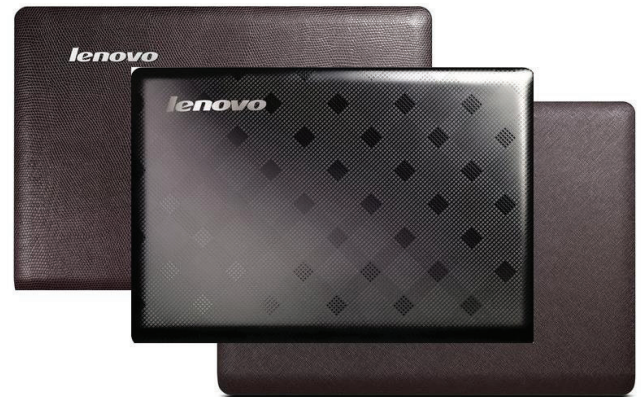
Lenovo IdeaPad U350 cover