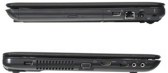
Lenovo IdeaPad U550 Lightweave pattern cover