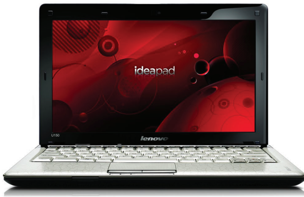
Lenovo IdeaPad U150