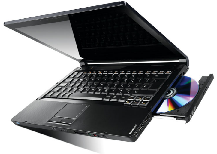
Lenovo IdeaPad U330