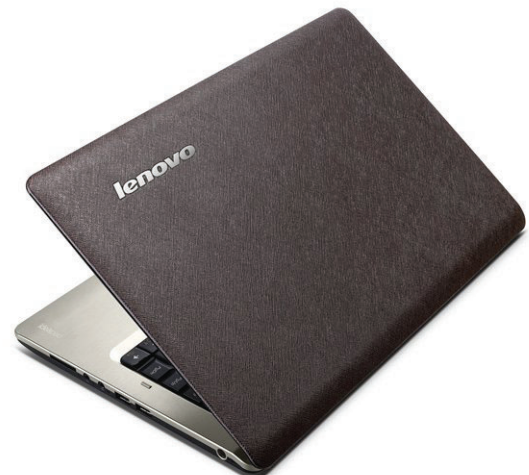
Lenovo IdeaPad U350 Lightweave pattern cover