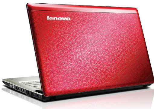
Lenovo IdeaPad U150 red cover