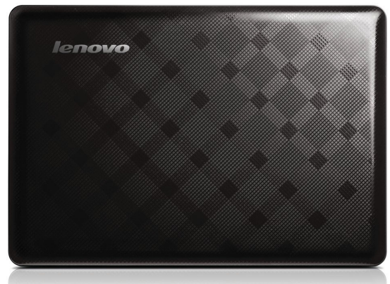
Lenovo IdeaPad U450p