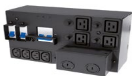
Front view Power Distribution (PD2-CE10HDWRMBS)