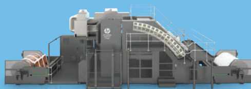
HP PAGEWIDE T1100 SERIES PRESSES

Open new opportunities with a combined solution of pre-print and digital in one inkjet web press.