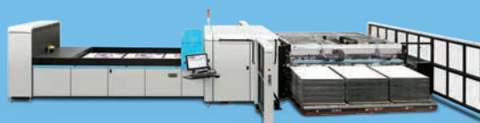
HP SCITEX 17000 CORRUGATED PRESS

Drive down costs - and improve your break-even point - with a highly productive press that lets you do more.