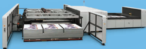
HP SCITEX 15500 CORRUGATED PRESS

Optimize time savings with high-volume production and job versatility, thanks to variable data and HP Multi-lane Print Architecture.