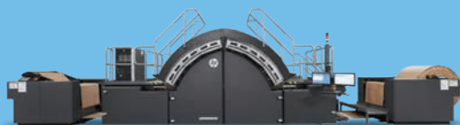
HP PAGEWIDE T400 PRESS

Create new business opportunities and gain new competitive advantages - while reducing turnaround time and waste. HP digital corrugated packaging solutions complement your analog capabilities, giving you greater flexibility to address short-runs, accelerate time to market, and simplify your production processes. With HP, you can turn dynamic market requirements into new growth opportunities for your business.