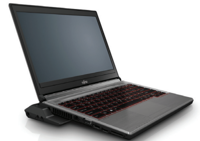
Shown with optional Port Replicator