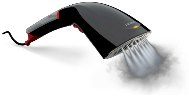
Handheld garment steamer