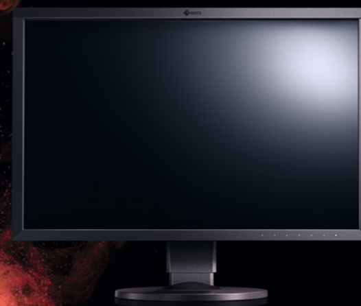
CS ColorEdge CS Prosumer more on page 12