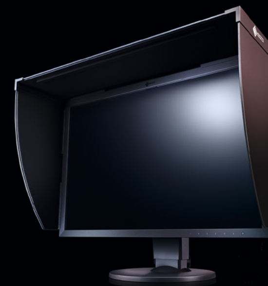
CG ColorEdge CG Professional more on page 16