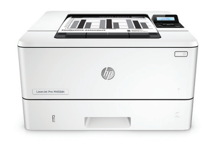
HP LaserJet Pro M402dn

Printing performance and robust security built for how you work. This capable printer finishes jobs faster and delivers comprehensive security to guard against threats.<sup>1</sup> Original HP Toner cartridges with JetIntelligence give you more pages.<sup>2</sup>