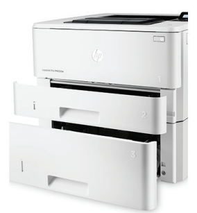
HP LaserJet Pro M402dn with optional 550-sheet tray