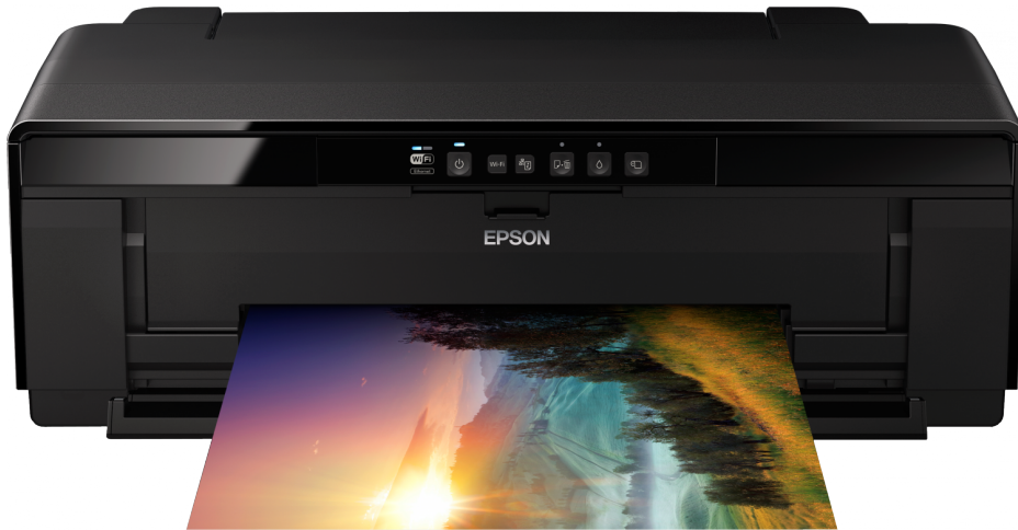
Photo enthusiasts can create professional-quality photo prints on a range of media in the home and studio

The SC-P400 combines professional pigment inks and enhanced connectivity in one affordable package. Perfect for creating glossy photos in sizes up to A3+, it provides the ideal entry into professional photo printing. It also comes with a range of mobile printing options and flexible connectivity features, making it extremely easy to use.