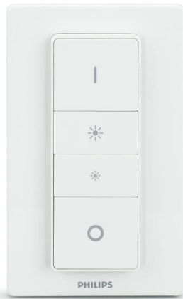
Philips Hue Dimmer switch