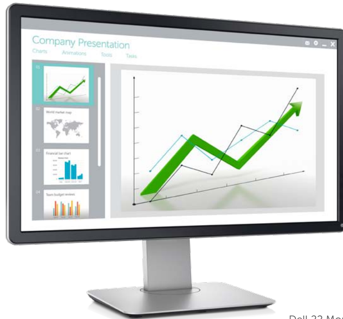
Dell 22 Monitor Model P2214H OEM Ready (21.5", 54.61 cm VIS)