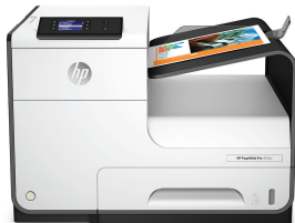
HP PageWide Pro 452dn Printer

Dynamic security: Cartridges with non-HP chips might not work today or in the future. Learn More: http://www.hp.com/go/learnaboutsupplies