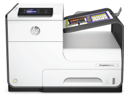
HP PageWide Pro 452dw Printer