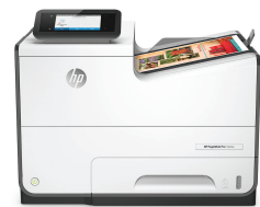
HP PageWide Pro 552dw Printer