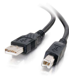
1m USB 2.0 A/B Cable