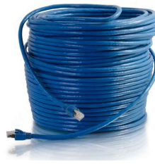
30m Cat6 Booted Unshielded (UTP) Network Patch Cable