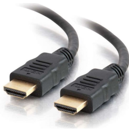
1m High Speed HDMI® with Ethernet Cable