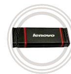
Lenovo™ OTG USB Flash Drive C590