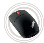
Lenovo™ 300 Wireless Compact Mouse