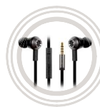
Lenovo™ 500 Earbud Headphone