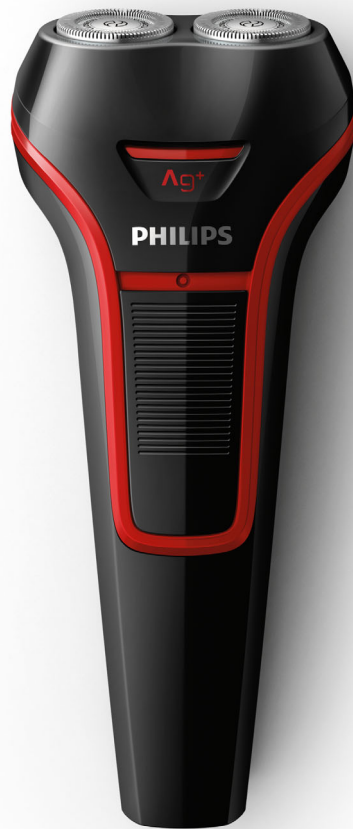
Philips 100 Series Electric shaver