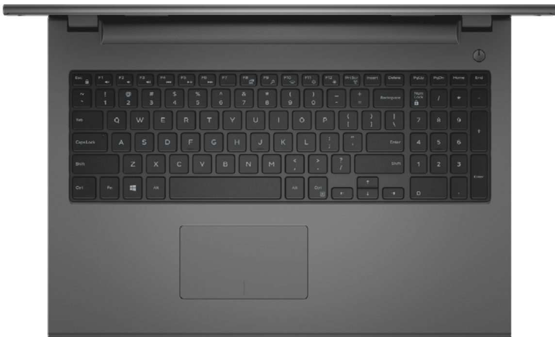
10-key Numeric Pad