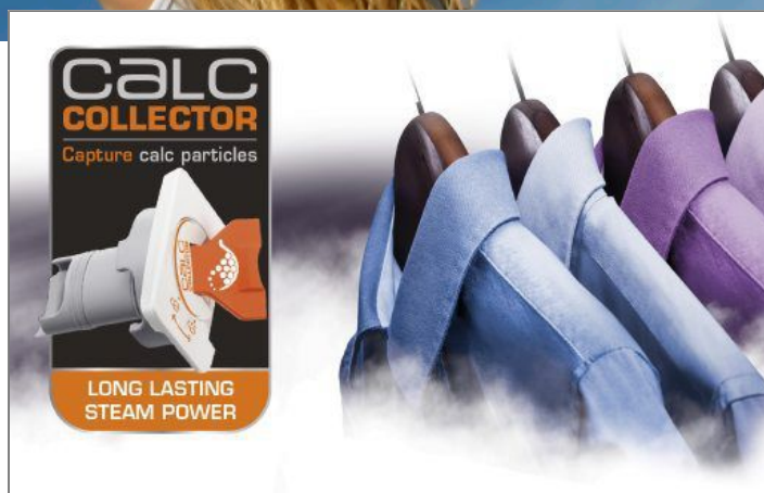
ULTIMATE ANTI-CALC FV9740 Steam iron Ultimate anti-calc FV9740E0