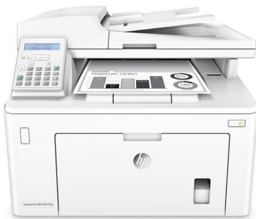
HP LaserJet Pro MFP M227fdn

Get more pages, performance, and protection 1 from an HP LaserJet Pro MFP powered by JetIntelligence Toner cartridges. Set a faster pace for your business: Print two-sided documents, plus scan, copy, fax 15 , and manage to help maximize efficiency.