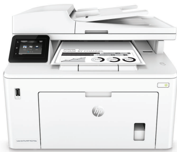
HP LaserJet Pro MFP M227fdw