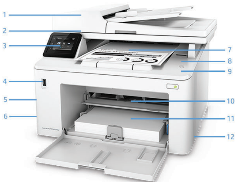
HP LaserJet Pro MFP M227fdw