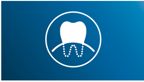
Philips Sonicare toothbrush with Sensitive Mode: Gentle, yet thorough cleaning for sensitive gums