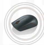
Lenovo 300 Wireless Compact Mouse