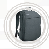
Lenovo Casual Backpack B200