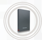
Lenovo UHD F309 1TB Portable Secure Hard Drive