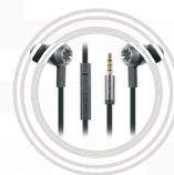
Lenovo 500 Extra Bass In-ear Headphone