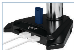
Powered USB Hub