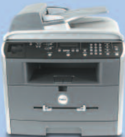
Dell Multifunction Laser Printer 1600n

Print, scan, copy, and fax with the Dell Multifunction Laser Printer 1600n. Fast, durable, and versatile, the 1600n is an excellent solution for a small workgroup or single users.