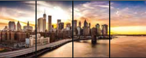
1 x 4