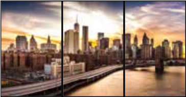
1 x 3