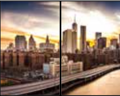
1 x 2

Can enjoy much larger OLED display by tiling up in a horizontal position.