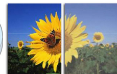
With SmartImage Without SmartImage

SmartImage is an exclusive leading edge Philips technology that analyzes the content displayed on your screen and gives you optimized display performance. This user friendly interface allows you to select various modes like Office, Photo, Movie, Game, Economy etc., to fit the application in use. Based on the selection, SmartImage dynamically optimizes the contrast, color saturation and sharpness of images and videos for ultimate display performance. The Economy mode option offers you major power savings. All in real time with the press of a single button!