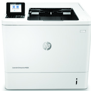
HP LaserJet Enterprise M608n

This HP LaserJet Printer with JetIntelligence combines exceptional performance and energy efficiency with professional-quality documents right when you need them – all while protecting your network from attacks with the HP's deepest security 1