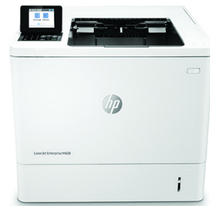
HP LaserJet Enterprise M608dn