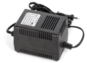
AC24V/3A Power Supply