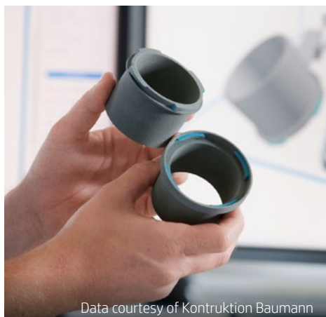
Data courtesy of Kontruktion Baumann