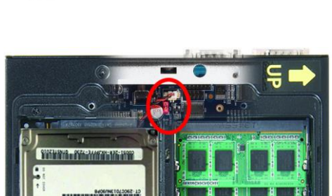
Location of Jumper J9