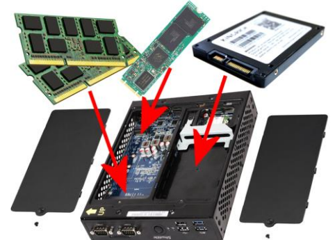
2,5" SSD oder Festplatte