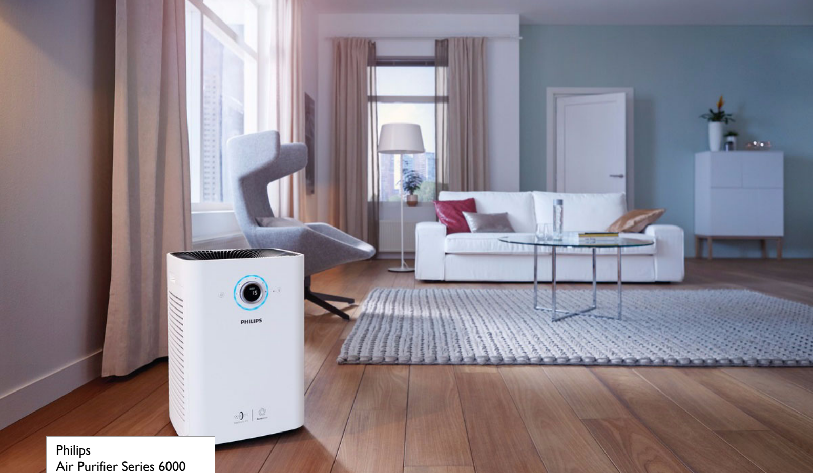
Philips Air Purifier Series 6000