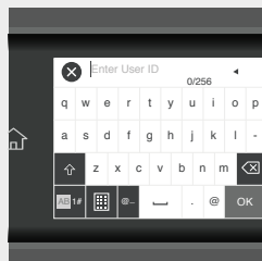
User ID & password