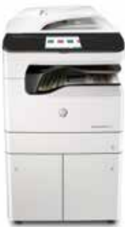
HP PageWide Pro 777hc Multifunction Printer