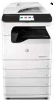
HP PageWide Pro 777z Multifunction Printer

Dynamic security enabled printer. Only intended to be used with cartridges using an HP original chip. Cartridges using a non-HP chip may not work, and those that work today may not work in the future. Learn more at hp.com/go/learnaboutsups