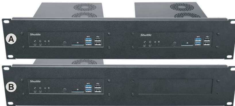
A) Two mounted PCs B) One mounted PC and additional cover plate