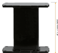
Extender for 2-part height adjustable aluminum columns