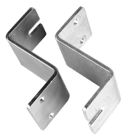
2 galvanized wall mounting brackets