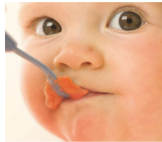
Recipe booklet Nutritious meals made easy

Discover the 12 age-appropriate recipes and weaning advice to help you to give your baby a healthy start in life and to set good, lifelong eating habits.