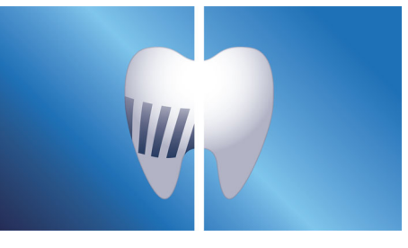
*Removes up to 100% more plaque from hard-toreach places than a manual toothbrush