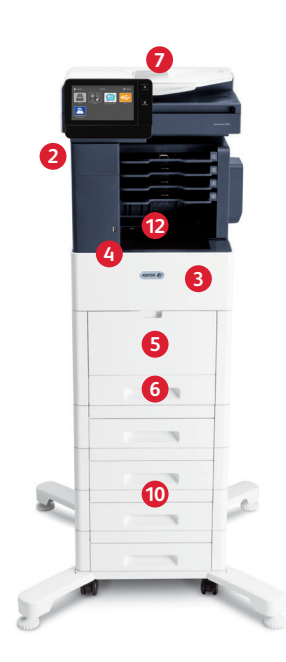
Xerox® VersaLink C600 Colour Printer