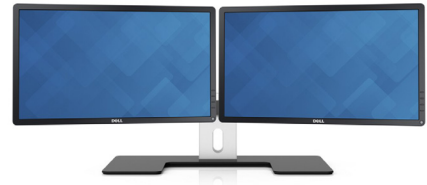
Dell Dual Monitor Stand