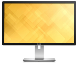
Dell 24 Ultra HD 4K Monitor | P2415Q