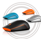
Lenovo™ 500 Wireless Mouse