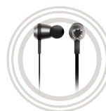
Lenovo™ 500 Extra Bass In-Ear Headphone