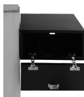
Lockable notebook cabinet