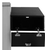
Lockable notebook cabinet