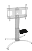
Laptop side shelf