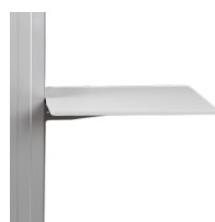
Side shelf for laptop