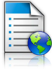
Forms and Favourites

Display Customisation: Display a customised, scrolling slideshow on the colour touch screen to communicate important messages to users while the printer is in Power Saver mode.