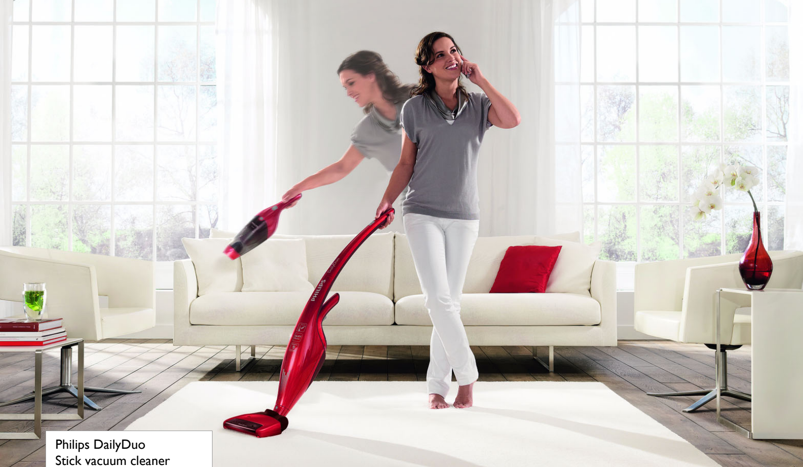
Philips DailyDuo Stick vacuum cleaner

Cordless 2in1: stick&handheld Bagless Cyclonic 16.8V battery 2-stage HEPA filtration