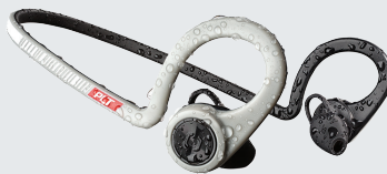
Easy-access on-ear controls