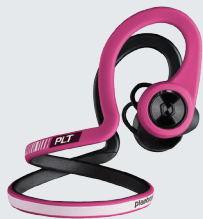
Flexible neckband design