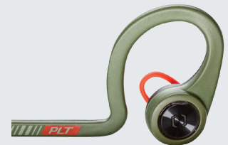
Rich, immersive audio