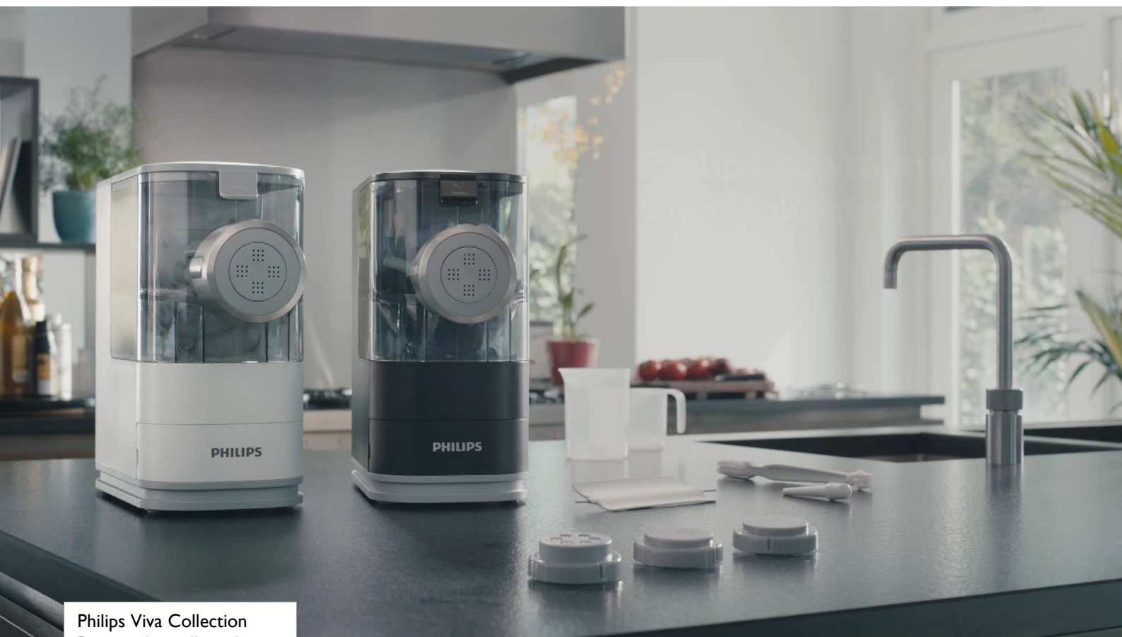
Philips Viva Collection Pasta and noodle maker